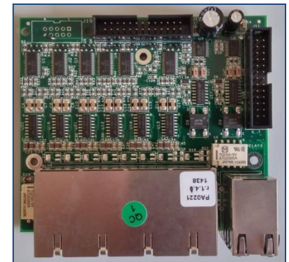
XR0035 Top View