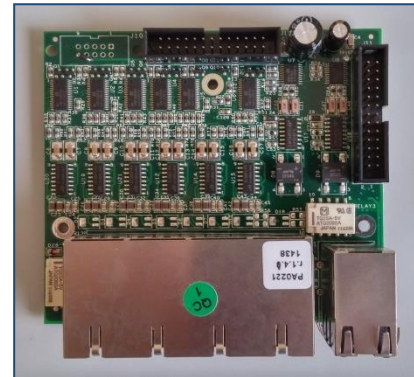
XR0126 Top View